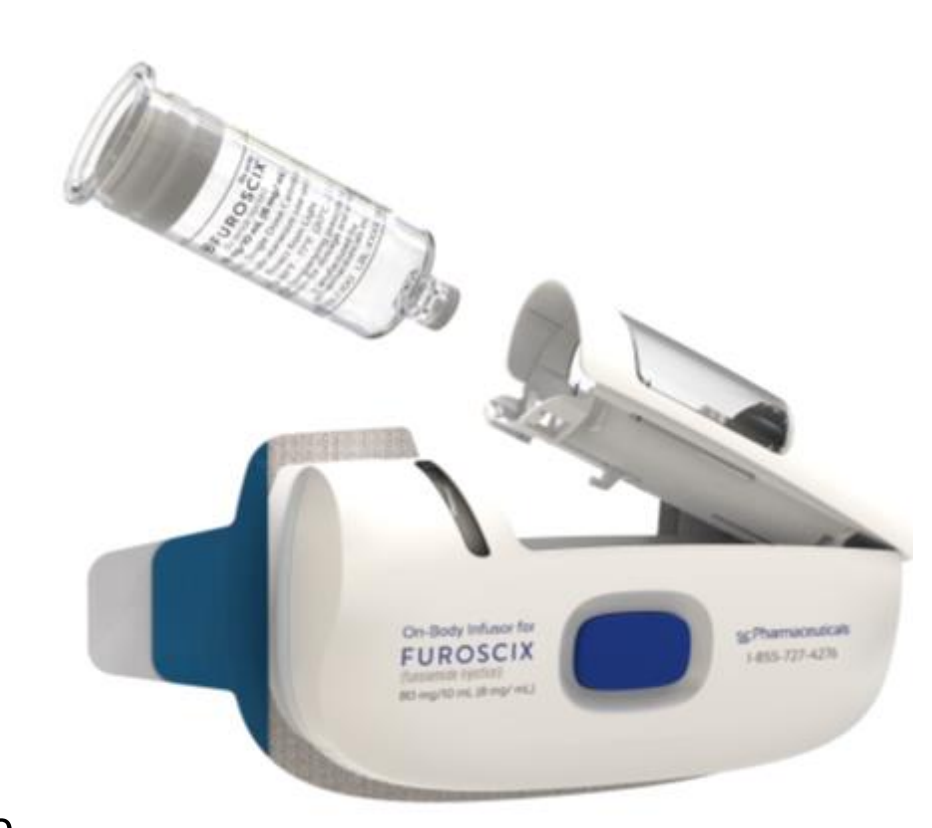
Figure 1. Furoscix On-body infusor